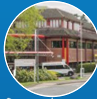
5. Princess Royal Hospital