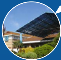
2. Worthing Hospital