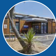
3. Southlands Hospital