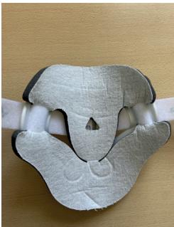
Aspen Back panel