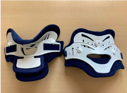
Miami J collar pads

We recommend the collar pads are changed daily, when you have your collar care done. We suggest, when changing the pads, that you remove one pad at a time and replace with the clean one rather than removing all the pads at once as this helps ensure you are putting the replacement pads in the correct place. It is important to ensure that any hard plastic edges are not in contact with the skin.